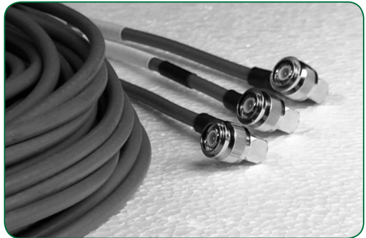
RF Coaxial Cables

EMTEQ proudly offers two families of coaxial cables including low smoke, zero halogen, aircraft grade polyethylene and high temperature polytetrafluoroethylene. These designs meet or exceed FAA and OEM requirements. For more information about our coaxial and specialty cable offerings, visit www.emteq.com or call your EMTEQ sales representative.