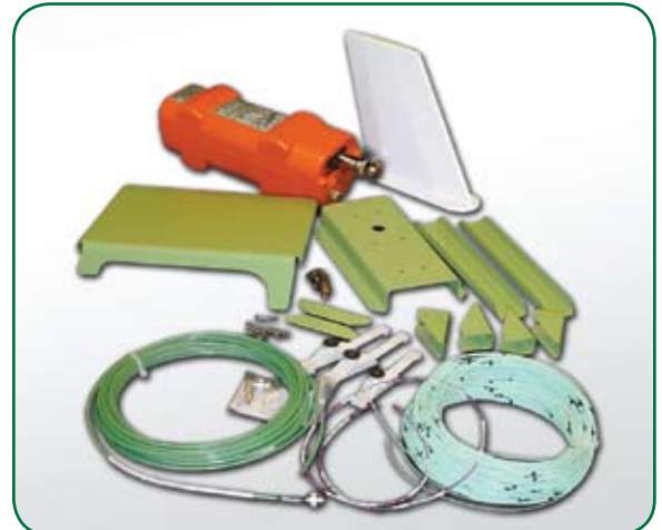
ARTEX turnkey ELT installation kit