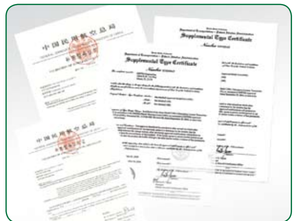
EMTEQ provides turnkey ELT solutions with certification